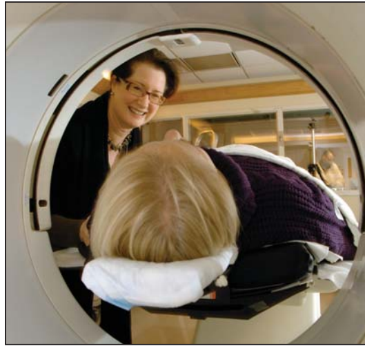
Patient enters PET scan machine.