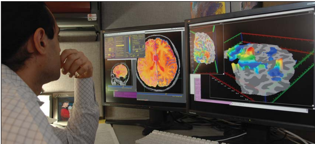
Researcher analyzes FMRI brain images.