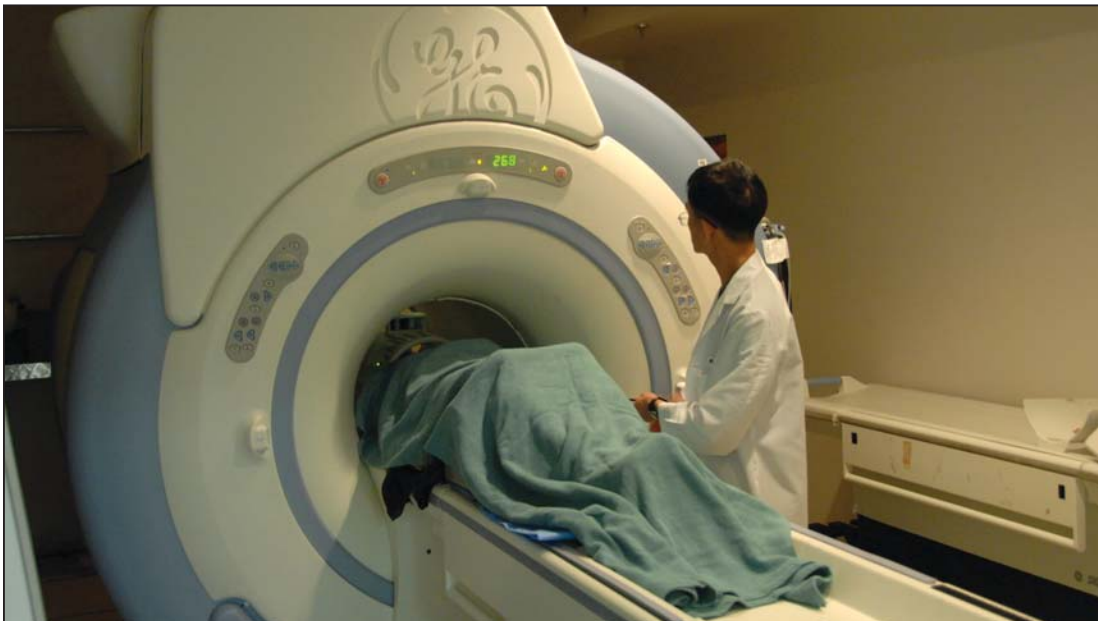
Technician checks MRI machine.

This research also is helping to reveal biological pathways that guide thoughts and emotions, and how experiences, medications, or environmental substances affect the brain. Scientists can use this information to design better screening and prevention for specific disorders, and improve on the delivery and effectiveness of mental health treatments.